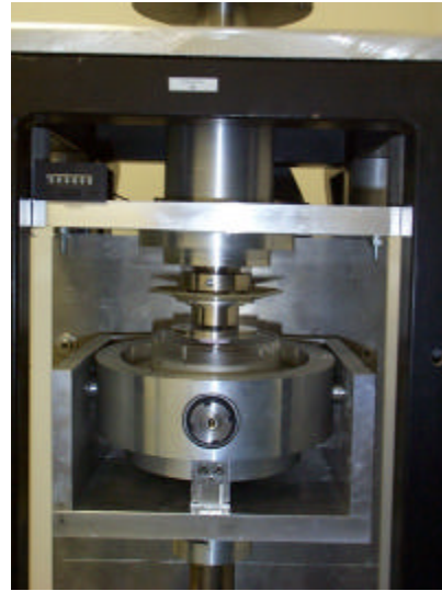
Fig. 1: Ring-on-disc testing device for the determination of tribologic properties.

In the pin-on-disc test the wear volume can either be determined by the changed geometry of the specimen (shortening of the pin and determination of the wear track volume of the on the disc) or by the mass reduction of the specimens.